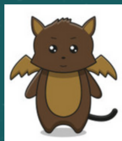
Pets that the user can choose from

We aim to increase user engagement on Husky Overflow through gamification. The pet features allows users to have a virtual pet, which can be changed or accessorized by spending coins, earned through playing games and engagement on the site. An additional game Rock Paper Scissors was implemented to play against other users in real time. We also added accessibility features with various color filters for the website, as well as screen reader support. Signatures were implemented to the question page to add user customizability.